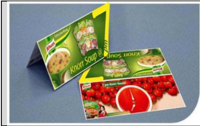
TICKET JACKETS- 40,000/Month