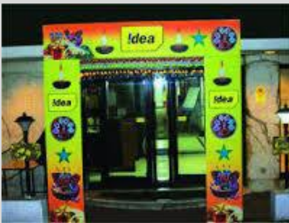
ARCH GATE- 50,000/Month