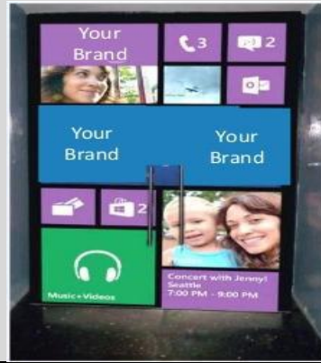
AUDITORIUM DOOR- 1 lakh per door/Month