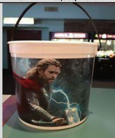
POP CORN TUB- 80,000/Month