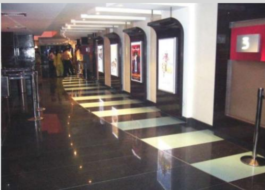
POSTER CASE- 35,000 Per translate/month