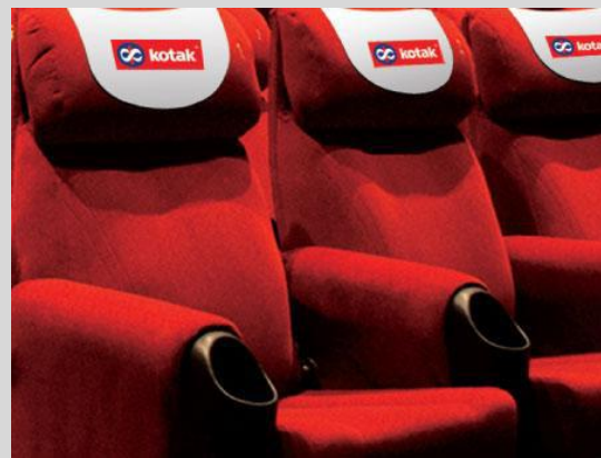
SEAT COVER- 1.5 lakh per audi/month